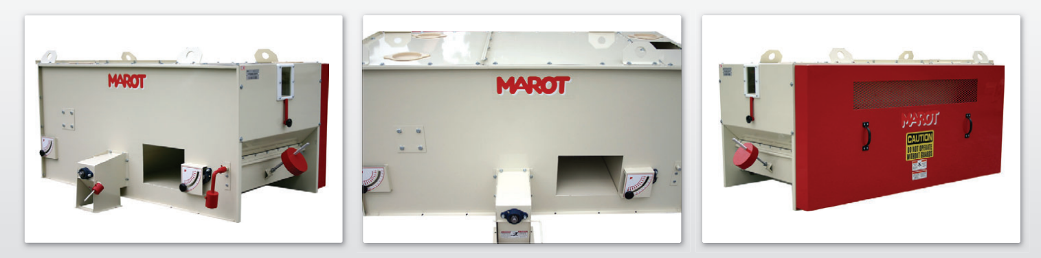
LIMITED GUARANTEE Our equipment is carrying a one year warranty on parts and labour.

* Based on wheat at 60 lbs/Bu at 16% MC, 2% FM.